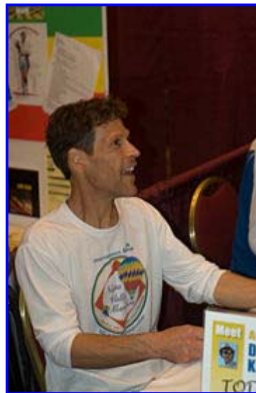
Dean Karnazes , signing books at the Napa Valley Marathon race expo

No future struggle, doubts, or failure can wipe away what you accomplished today. You have done what few will ever do—what you thought you could never to—and it is the most glorious, unforgettable awakening. You are a marathoner, and you will wear this distinction not on you lapel, but in your heart, for the rest of your life."